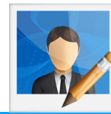
Image Editing Vocabulary