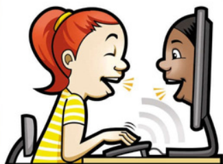
A Parent's Guide to Social Media