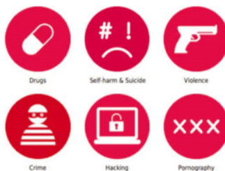
A Parent's Guide to Privacy Settings