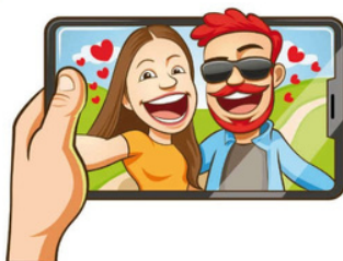
A Parent's Guide to Sharing Pictures