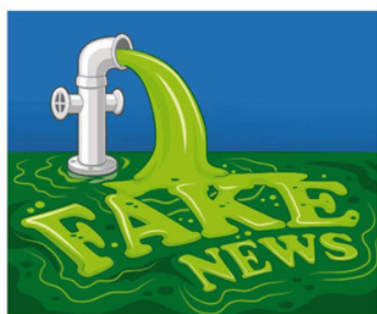
A Parent's Guide to Fake News