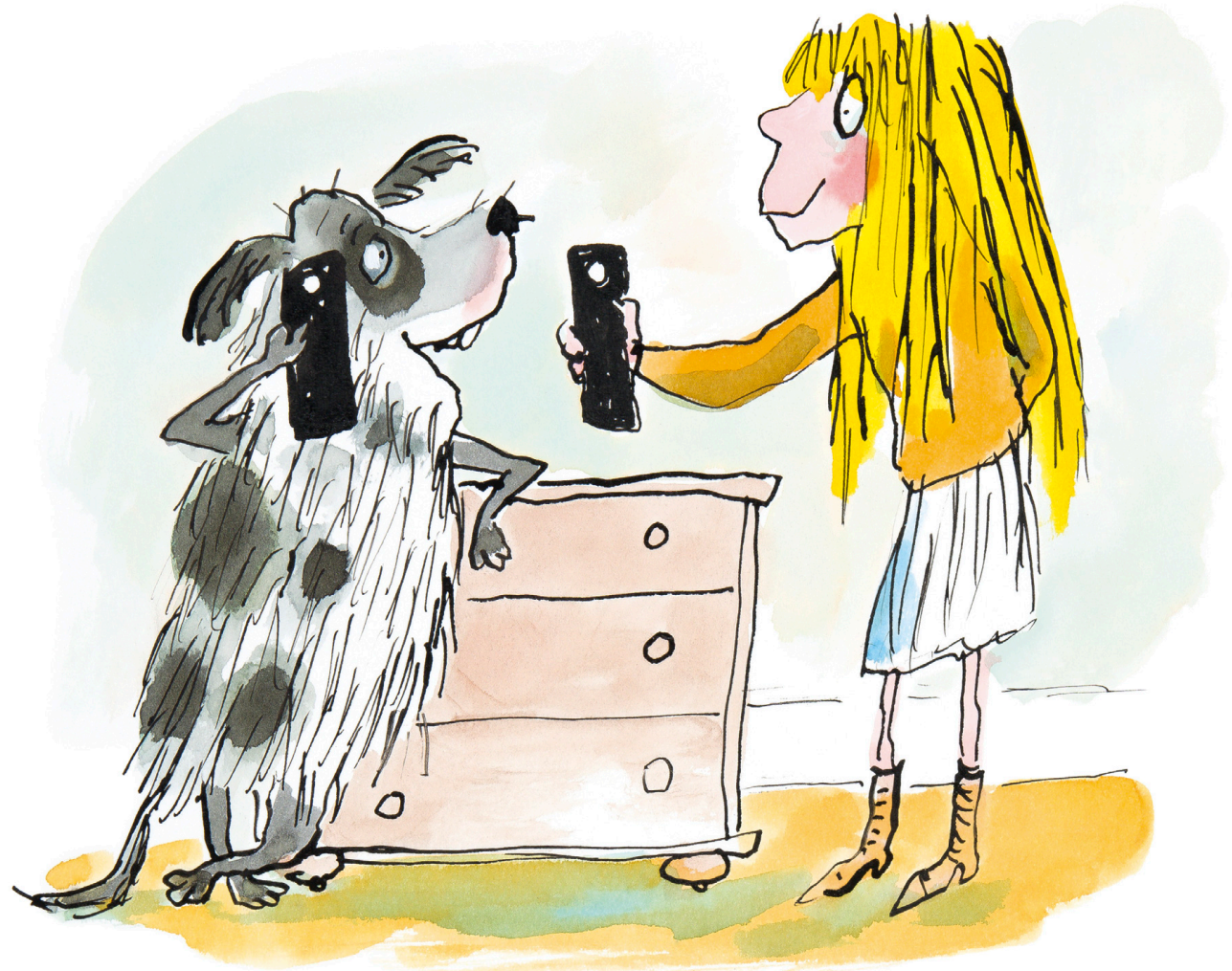
She shared a talking dog called Rover,